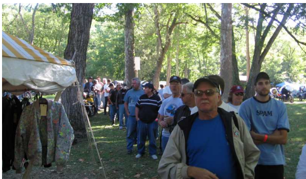
Must be a food line..

Early arrivals were not at the Hidden Valley Campground in Watkins Glen State Park and since the weather was threatening, I was lucky enough to get one of the few remaining rooms, the reason being the Maserati and Ferrari boys were in town for track days; since I'm sure not even one of those guys owns a tent, rooms were scarce.