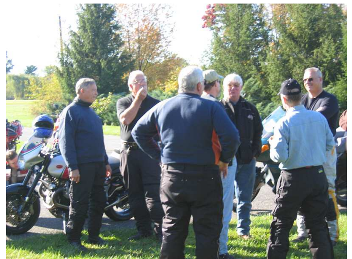
Some Shore Riders

No accurate count was made, but the number of Shore Riders was about 35. This made us the 'winning' club. We had more riders than either Skylands or New Sweden.