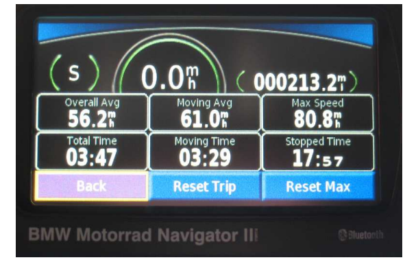
What you missed.. if you didn't join us

Roger suggested Uncle Bill's for lunch. It was a restaurant that had good food, large portions and pretty girls dressed in assorted costumes for waitresses. We had a nice lunch, some good conversation and then headed north on the GSP for the ride back to the Shore. Traffic was only moderate so we set a good pace and were home shortly after three.