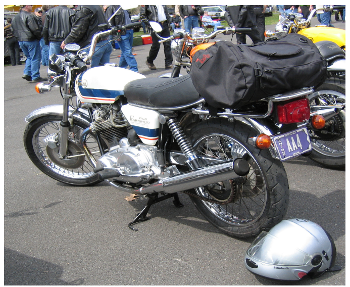
The last new bike I owned – 1974 Norton Commando Mk-III

Club members came along for the ride that left from Our WAWA at 10AM, and others showed up on their own. After spending a few hours browsing the bikes on display – we headed north for lunch in Frenchtown. By the time we were ready to go home, temps were in the high 60's – and it was a great day to ride.