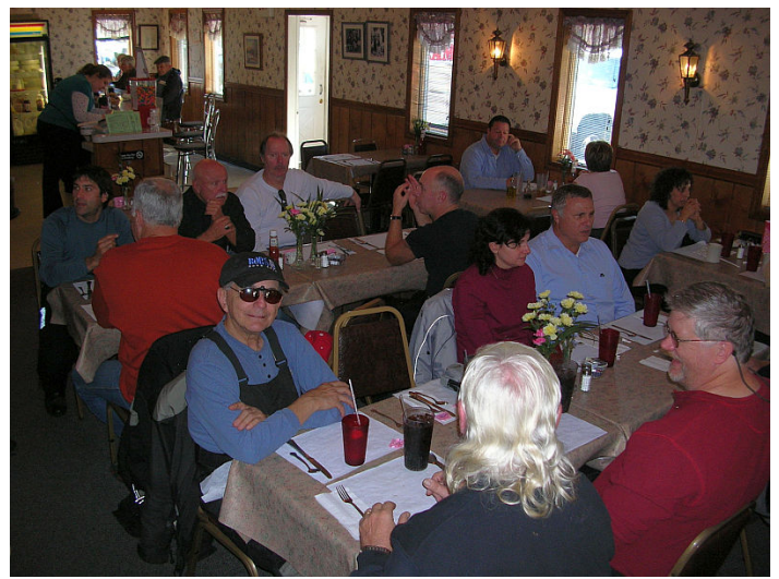
Lunch in Frenchtown, Cornerstone Cafe

we were there? In any event it was a good time especially after kidneys were tapped.