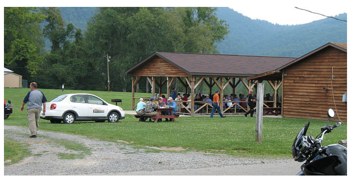
Chicken Lunch - couldn't be beat!

afternoon naps. We revived in time for dinner – which we had at the rather nice restaurant in the Canaan Valley Lodge. That was Thursday.