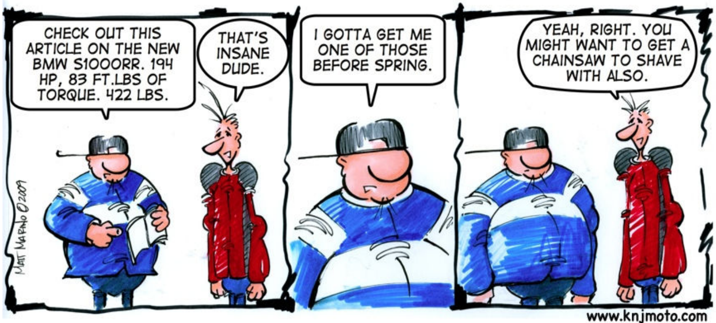
How long before RDS owns one?