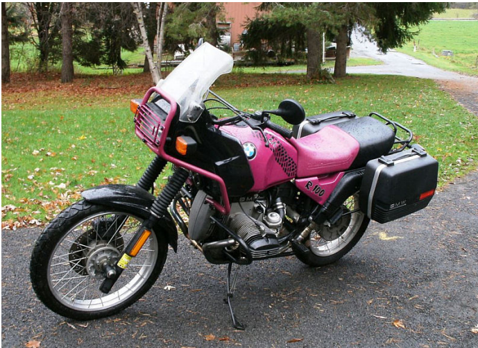
Barney - the purple GS..