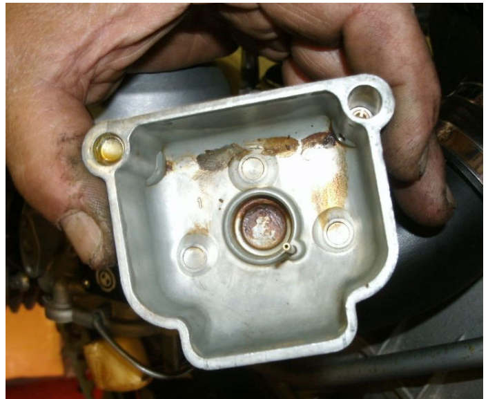
Carb bowl - not so bad..

The GS' tires had to be changed even though the rear Metzler looked new; the front was maybe 70% worn. The rear tire was dated 1999 and front 1993. Both were obviously too old to safely ride on. The previous owner said it had 3 sets of tires...which makes sense: 3 rd one on the rear at 27,000 miles (new condition) and 2 nd on the front (almost worn out). After all in 1993 the bike traveled around the US and then to Alaska. This type of long distance riding could have prematurely worn out the rear tire.