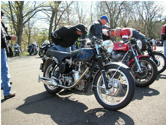
Velocette and MV Augusta