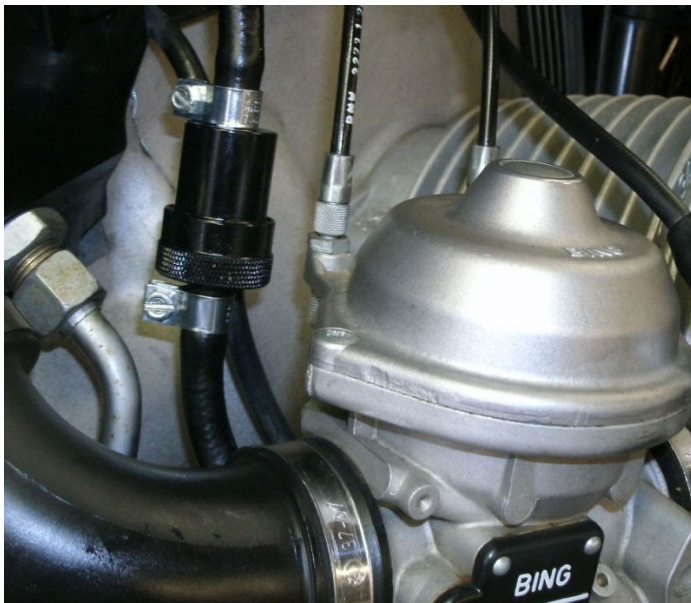
New fuel filter..

Valve settings were OK at spec. and new valve cover gaskets installed. One minor (but could have been major) problem occurred when I installed a new sparkplug on the left cylinder. It cross-threaded. A quick run to EPPY's tool supply on Route 9 to get a sparkplug thread chaser helped fix the problem.