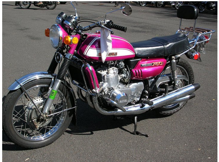
Suzuki Water Buffalo

The Gathering has grown every year I've been attending (and that's quite a few years) – the entire parking lot was filled with bikes, and the overflow parking lot was filled with bikes, and bikes were parked along the edges of the park roads. A great venue – right on PA Rt 32 – which makes for an entertaining ride to and from the event.