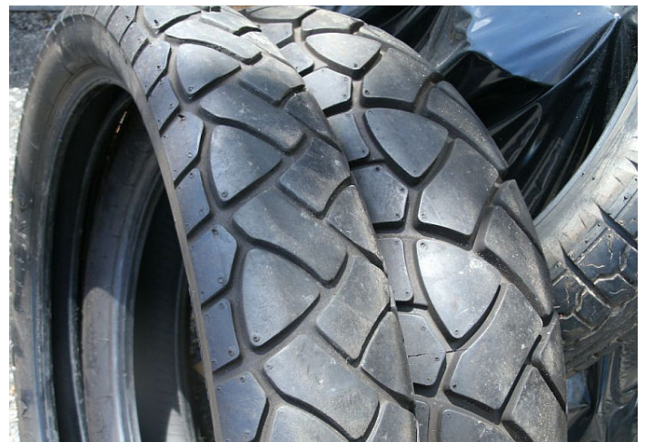
FREE TIRES - only 11 years old!

I rode it 200 miles this past weekend. It ran great however it rode funny. It felt like I was always riding on the crown of the road, with the bike mildly swerving to the right and then to the left. After reducing the tire air pressure from 40 psi in each to 32 front and 35 rear, it solved the problem.