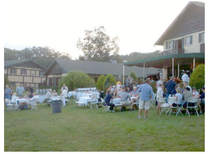
Tuesday, I decided to take advantage of the

The Resort had a nice pool, which I took advantage of, and an outside bar/pub overlooking the hills to the south. I can't speak about previous locations, but the UnRally organizer's selection of a central location was excellent. Good food, cheap beer (+!!), and breathtaking views. I was a little concerned that I would be treated as an outsider, but lots of folks came up to me, engaging in conversation. The Rally organizer's hosted an ice-cream social that night, which I managed to miss.