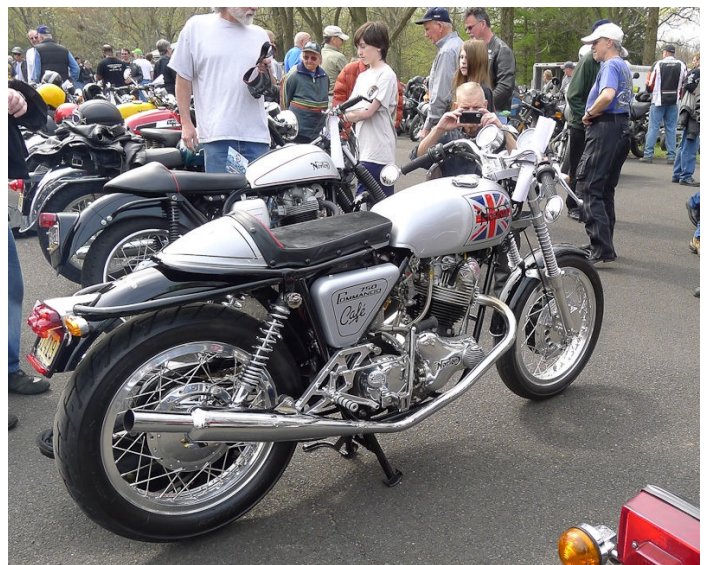
Early 70's Norton Commando Cafe Racer

It was well-attended. Lots of Nortons, including a brandy-new one that sells for about $17,000 and looks terrific. The dealer is Tremont which is located up in Skylands country. You will need a passport if you want to go there.