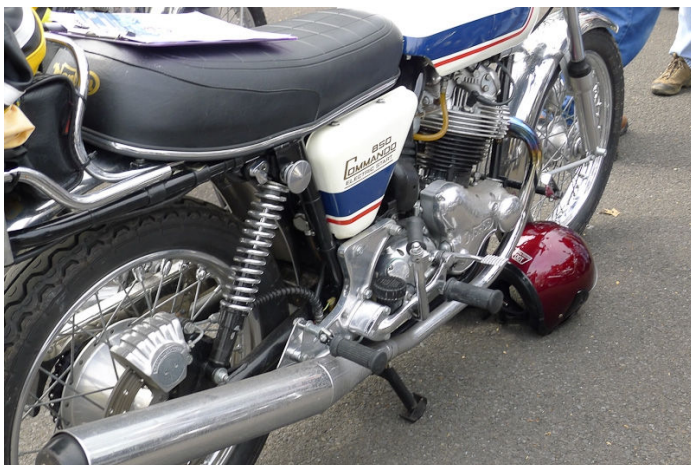
Editor: Twin to my '75 Mk-III Commando