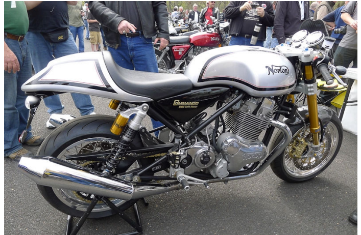
2012 Norton Commando Cafe Racer