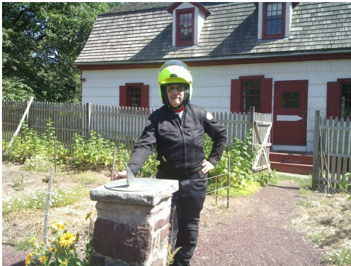
Johnson Ferry House

1. The Johnson Ferry House in Washington's Crossing State Park is accessible by entering the park proper. If you go on a weekday, admission is free. If you show up at 3:45 on a Saturday, like I did, the nice lady in the booth let me in for free since the buildings all close at 4:00.