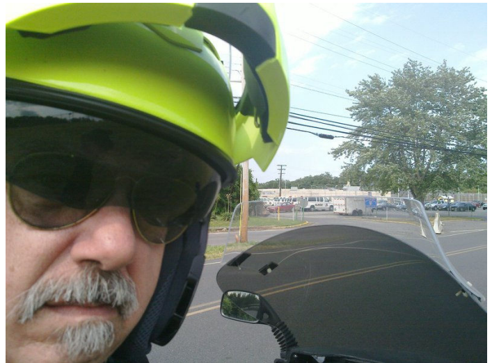
Mid-State Correctional Facility

3. Trenton Battle Monument isn't that hard to find, the tricky part is finding a place to park the bike while you snap a picture. I used the sidewalk across the street from the monument. (Note: a later visit approaching from the east had plenty of places to stop on the wide street. My first approach was from the north.