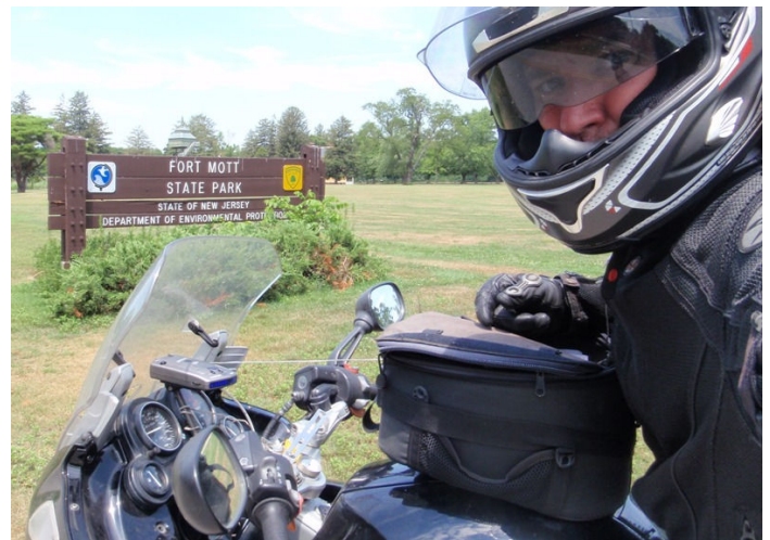
Fort Mott State Park and Historic Site

I've reached my goal for the FB in July but at a cost.