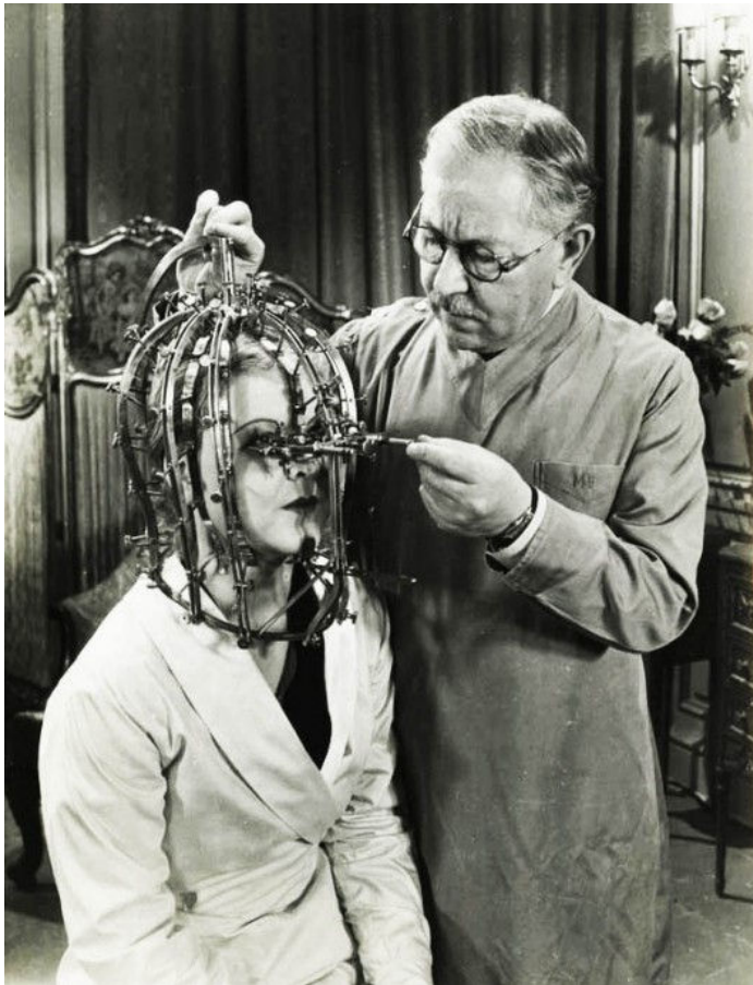
Fitting for the new Concept-3 "PRO" helmet is quite precise.

accepted, proof of the visit date shall be determined by the EXIF information embedded in the photo. Contest only open to dues-current club members. Decisions of the Judge(s) is(are) final.