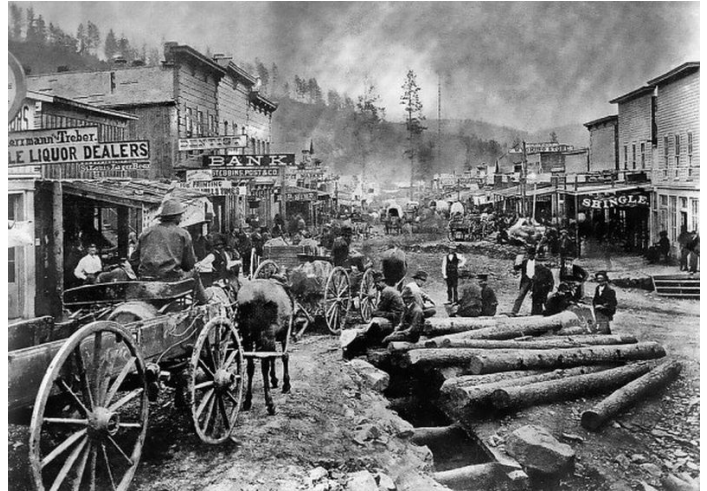
BMW-MOA national rally 2012