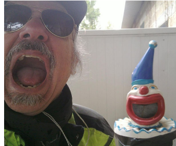
Two clowns at the Stone Museum

The Stone Museum is a trip (in several senses of the word), and really deserves some time spent off the bike. The "clown" in Don's description is waaaaay back from the road, you'll have an entertaining hike to nab a photo of it. Nothing challenging like the Carranza Monument, but memorable none-the-less.