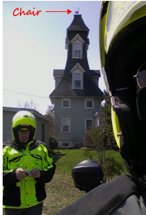
Chair on a roof..

After lunch my curiosity moved me to ask how they fared during the great tidal surge of October 29. Not so well it turned out. They had a 14 foot surge that caused a lot of damage to their buildings. They are on the bay and a couple of miles from the ocean. Volunteers were in the