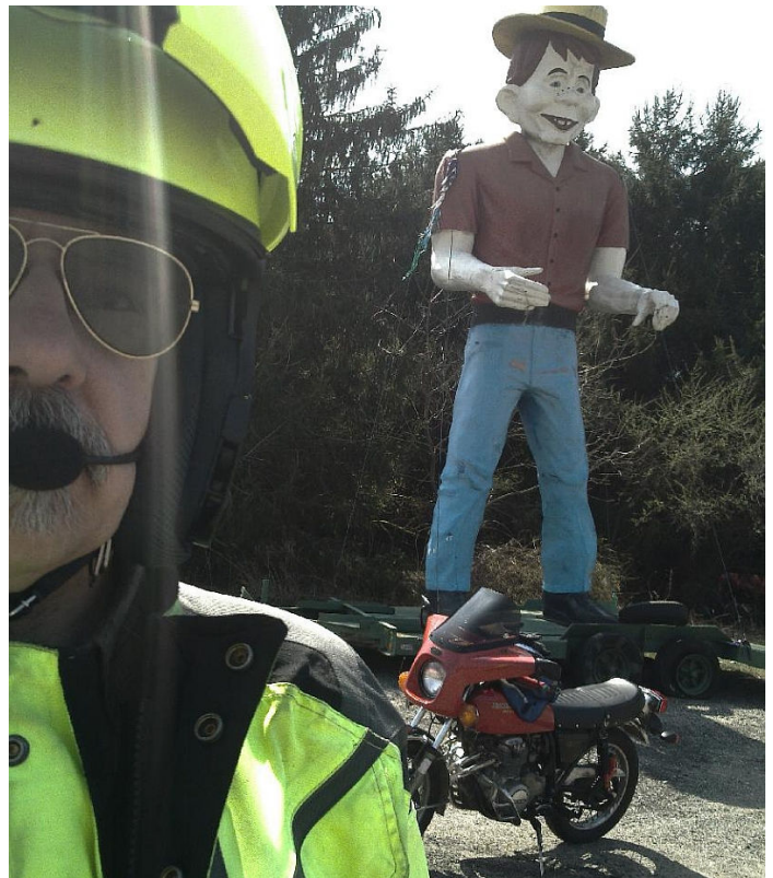
Muffler Man near OWW

The Muffler Man near "our Wawa" has been painted to look like Alfred E. Neumann (from Mad Magazine). Or else George W. Bush. Not sure.