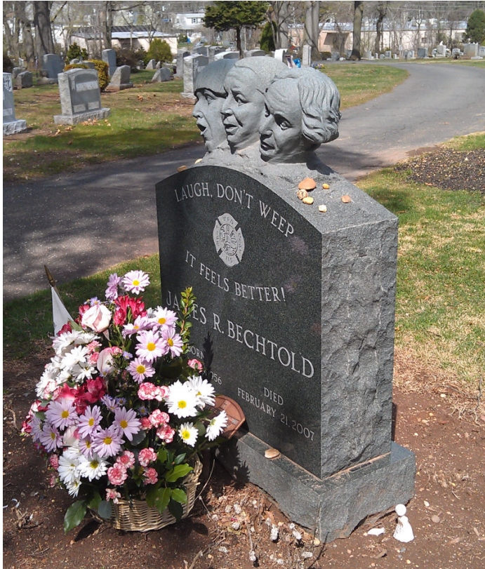
Laugh, Don't Weep, It Feels Better

stone immediately. It's right by the cemetery road and pretty easy to find.