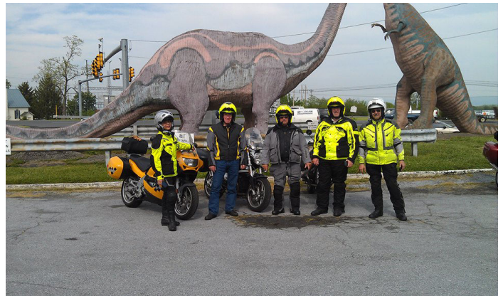
. Obligatory Dinosaur Pic at Stephen's City