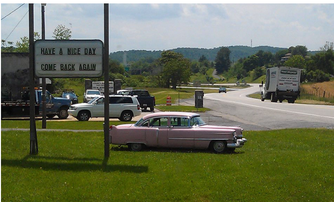
Pink Cadillac Diner - Natural Bridge VA

Nice ride for us - just about 200 miles of all back roads. Had lunch at the Cadillac Diner in Natural Bridge. Got the Presidential suite in the hotel, only problem is we have to strike the flag at night (our patio is right over the main entrance.) Good brats/burgers dinner with light and dark beers.