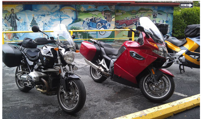
Three cozy bikes resting at the Cozy Inn.

Eventually our butts started getting a bit sore, so we decided to head for the Cozy Inn/Restaurant in Thurmont MD. We arrived about 3:30, in time for a nap if so inclined. The Cozy is where the major news networks house their reporters when the President is at Camp David. Apparently their per-diem isn't a lot since the Cozy rooms are a throwback to the early 1960's.. but they're clean, beds aren't awful, and it's cheap. Plus there is the Cozy Buffet right next door where you can stuff your face with unlimited amounts of fattening food for as long as you want. It perhaps explains the number of large-butt women we saw in the area.