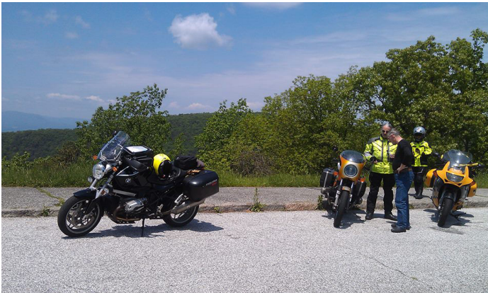
Doom and Gloom - NOT - along the BRP

Rosen) suggested it might be time to head east toward the hotel. They arrived about 5PM or so.