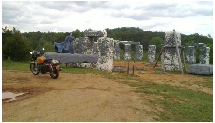
Foam Henge - Natural Bridge VA