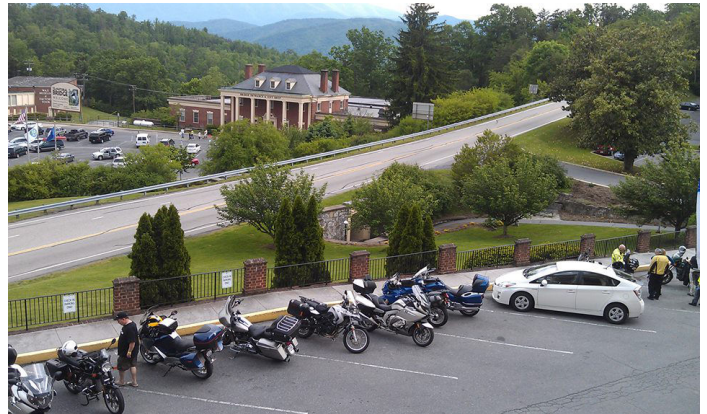
View from the Presidential Suite balcony at Natural Bridge