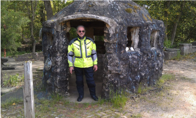
Ticket Booth at Palace of Depression

centric guy who was also pretty good at getting publicity for his creation, such that the Palace was a tourist attraction during the Depression. After he was jailed for leading the FBI on a "wild goose chase" for a kidnapper, the locals (in Vineland) tore the Palace down. Today it is being "rebuilt" from donated rubble by a small team of enthusiasts. Original photos are being used as a guide but I think there is also a lot of improvisation being done.