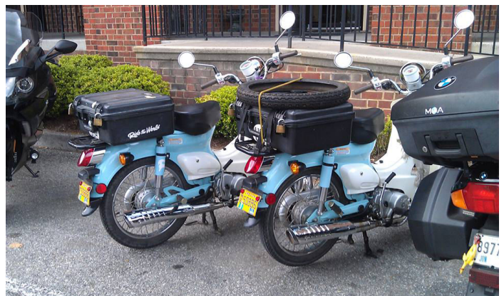
"Underbone" Bikes - 101cc, went around the world..

Saturday evening was Morton's big banquet. Grant cannily selected a table for us that was the very last one called for the buffet. There was some food left when we got up to the buffet.