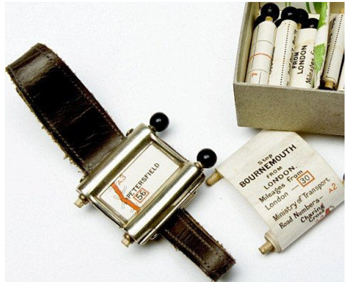
. Luddite GPS

How about getting off your duffs and doing it? We'll be visiting the BMW event "Colors in the Catskills" - and riding the German Alps (upper Catskill mountains.) It's a great riding area, the Colors event is nearby and free, and the Crystal Brook is a bunch of fun.