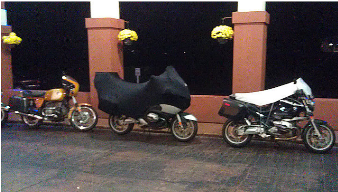
Tucked in for the night - Bangor ME

Today we traveled down the length of Maine after leaving Bangor this morning (Bangor is about the northernmost civilized part of Maine..) and the closer we got to the metro areas (Boston in particular) the worse the drivers became. It appears most of the bad Boston drivers have now moved to New Hampshire, where they've adopted a strange passive-aggressive driving style. They hesitate to pull out about forever, then aggressively pull out right in front of you or another car. Universally - Pennsylvania drivers are the absolute worst. Every time we saw some dolt in a cage crossing 4-5 lines of traffic at a toll because they were in the EZPass lane - the vehicle had PA plates on it. I wish they'd stay in Pennsylvania where we can just avoid them.