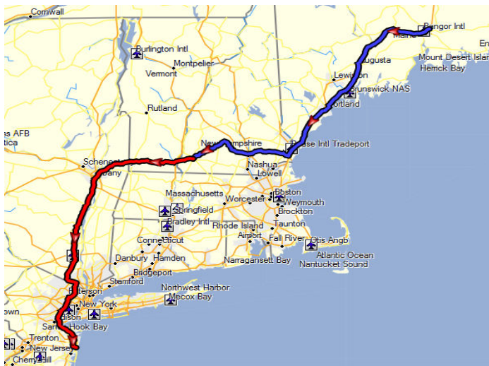
Final Two Days

Last heard from – the intrepid group of 3 travelers was overnighing at the Comfort Inn in the shopping mall in Bangor Maine.