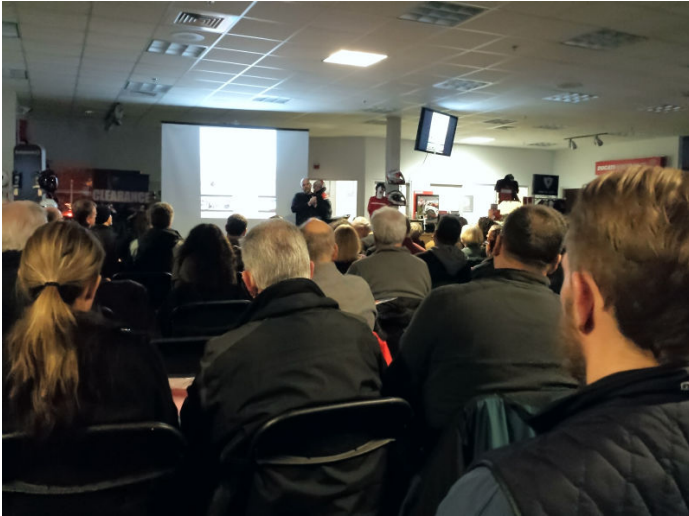
Cross Country Presentation

His trip took four years - and took him through all the continents. One thing he noted - which I've heard from every other round-the-world traveler I've met - people in the country you're in will warn you about crossing into the next country (murderers, rapists, thieves, bad-people) - and it just isn't true. When you get into the next country - they'll be surprised you survived the country you just left.