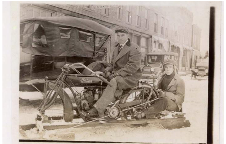
It's been that sort of winter