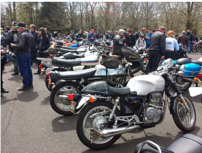
My fake Velocette and real Commando and participants.

not as comfortable as a pair of Lee Parks although for summer use, this Vanson would be cooler. These are my go-to hot weather gloves.