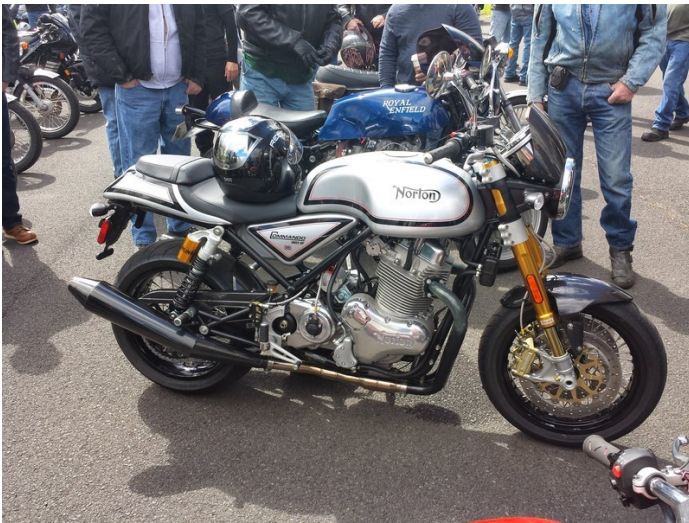
The new Norton 961, fresh on our shores.