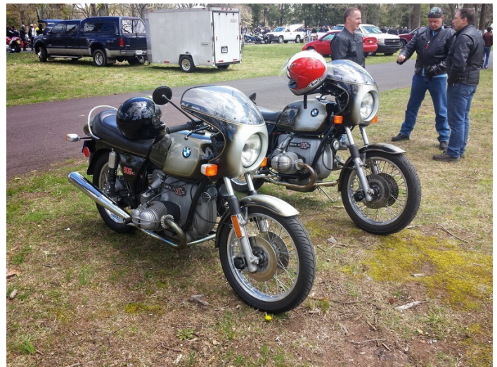
A brace of R90S's at the Gathering.