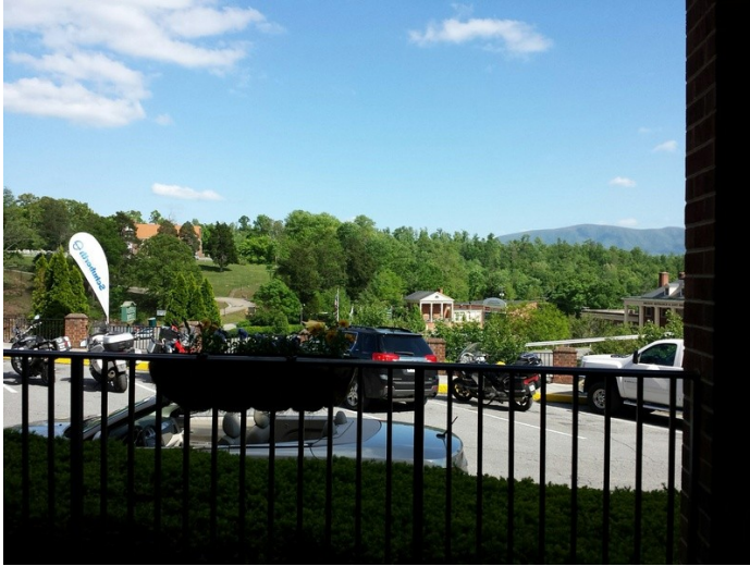
View from the Natural Bridge veranda

OK - back to the rally. I managed to dodge all the predicted dire weather by timing my ride right. On Thursday I got as far west as I could before the front moving in (with heavy rain and thunderstorms) got to where I was heading. If I hadn't dawdled for 15 minutes at lunch it would have been an entirely dry ride. Instead the last 15 minutes were very wet.