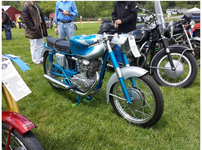
Ducati 200 – look at that gas tank!

This event doubled as "the world's shortest honeymoon", as my bride accompanied me on the Moto Guzzi on the ride south into Maryland Saturday afternoon after the "wedding reception".