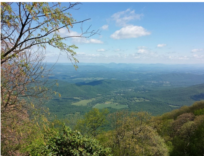
Blue Ridge Parkway overlook

The front pushed eastward overnight, and Friday morning dawned overcast and drizzly. By 10AM when I pushed off from the motel (remember what I said about being able to sleep late?) the rain had completely ended and the roads were drying off. By 1PM - the sun was out, temps were moderate (about 50F) and riding was perfect.