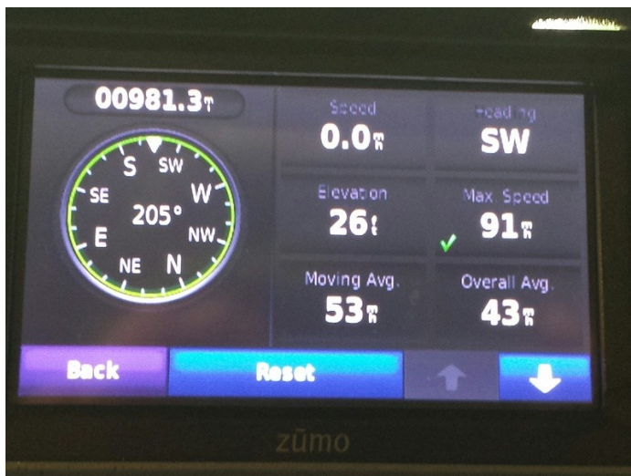
Home again. 981 miles later. . .

A few hours later, after lots of good conversation - it was off to an early night, and up at the crack of dawn the next morning (my roomie was taking off at 7AM - he had a talk to give at 1PM in PA.) I left the hotel about 8:45AM, and decided to decide if I wanted to do a 1 day or 2 day trip home. To get me in the swing of things, I got on Rt 81 and started north. Rt 81 is generally a crowded road, but wasn't awful on a Sunday morning. I passed right by Stephen's City, Winchester and ended up in PA at the PA Turnpike. Since it was only a bit past noon - I decided to press on, and headed east.