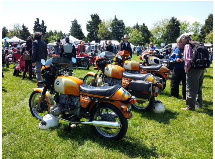
Three Daytona Orange R90S

I ran into some friends from NJ but fewer than expected as the Norton guys were mostly missing. I did run into some Airhead BMW guys I know from the PA Supertech.