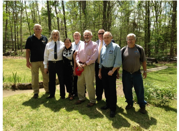
NJSBMWR members at my wedding.