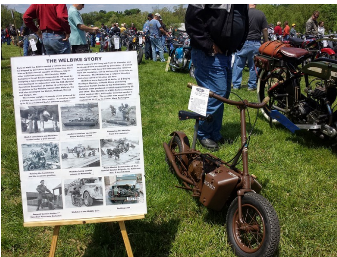
Welbike, WWII paratrooper's motorcycle