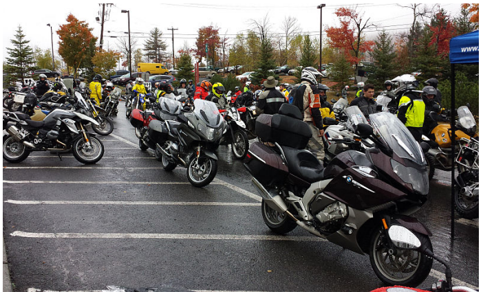
A rather wet demo fleet from Max's BMW