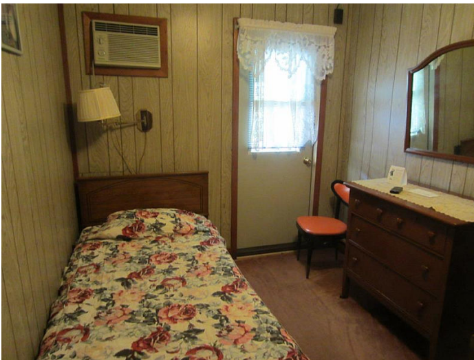
Crystal Brook single room

I'm sure Don or Dan will expand Crystal Brook Resort. http://www.crystalbrook.com/