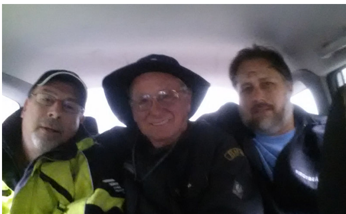
It rained hard enough Saturday that we caged to Hunter Mountain. A bit cramped in Dud's Toy.. these are not small boys..