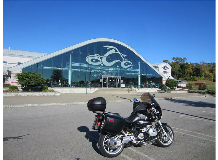
Orange County Choppers

ange County Choppers, the apparent Mecca for the Biker crowd). Arriving on a Beemer outfitted in my ATGATT mode with full coverage helmet I was ignored by the sales staff as I wandered thru the high holy grounds of the biker community. I was surprised that many of the bikes from the show are still sitting in the showroom for sale. Not my flavor of motorcycles but interesting never the less. At 10 AM I headed back to the museum.