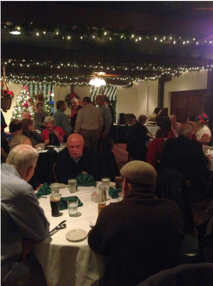
Holiday Party Crowd