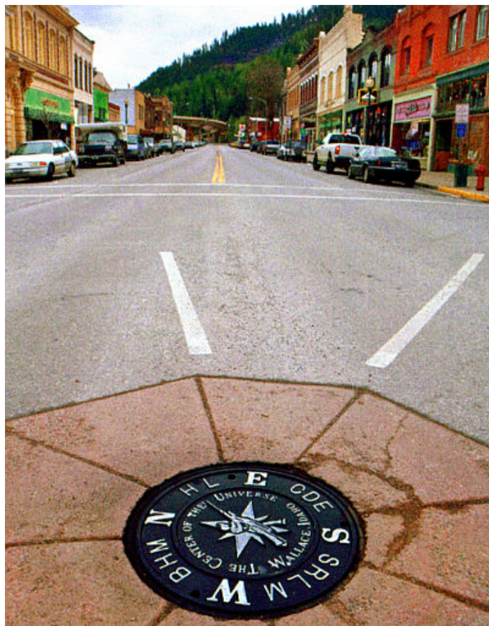
The Center of the Universe