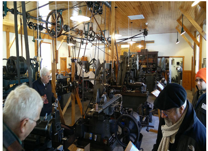
Tuckahoe Machine Shop Museum

Tuckahoe Steam and Gas is comprised of a number of barn-sized buildings, one devoted to old machine-shop apparatus, one devoted to early 20th century rural life, one to shelter the steam tractors, etc. The volunteers who run Tuckahoe Steam and Gas agreed to open the museum buildings, turn on the heat and lights, and gave us a tour of the machine shop and rural life buildings on Friday.