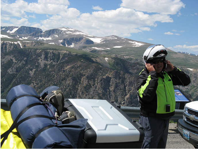
View from the Bear-Tooth Highway