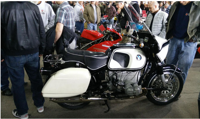
BMW /2 conversion with modern motor, front end, Wixoms