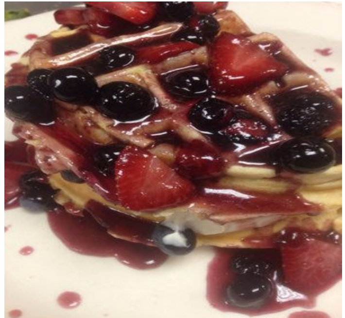
Berry Stuffed Waffle from Taylor Sam's

For a more eclectic breakfast, Turning Point behind Houlihan's in Brick is a solid choice. The breakfast menu is extensive, creative and interesting. The coffee is French press and very good. I have tried their Big Easy Benedict, bananas foster waffles, OMG (oh my god) French toast, pesto infusion skillet and garden frittata, all excellent. There seems to be more city slickers and "sophisticates" eating here and the parking lot is filled with late model cars. It's just a bit pricier than diner fare but still good value.