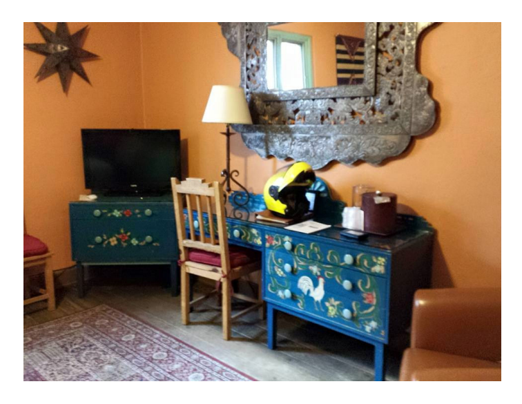
The pics will tell the story. — at Winslow, AZ.

Serendipity. If i hadn't picked the back route, and then changed it on the fly I'd probably be staying in a Comfort Inn in Flagstaff.