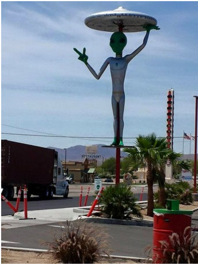
Alien Fresh Jerky

So on the road at 9:30, Doofus predicted I'd be in Barstow by 12.30PM. Well its 1PM and I'm almost there. About another 10 miles. And that's where I'll hide from the heat until tomorrow at the crack of dawn..