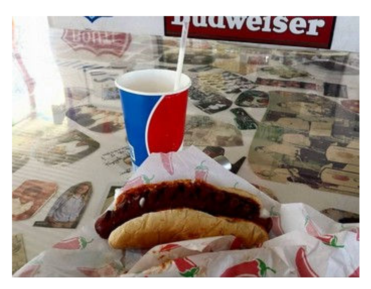
Chilli dog with onions and cheese.

Oh, where was I standing in line? Delgadillios shake shop. The owner is most kindly described as eccentric. Or crazy smart.