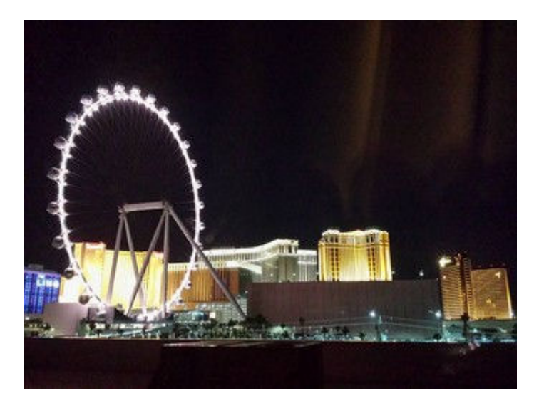
May 28<sup>th</sup> – Las Vegas to Barstow