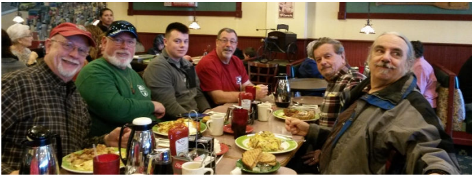
Amy's - Long Branch

Next one - this Saturday (Feb 6th) at JB's diner - http://jbsdiner.com - intersection of Rt 537/Rt 524 just west of Freehold (205 Monmouth Roadm Freehold, NJ 07728) 10AM. Be there!