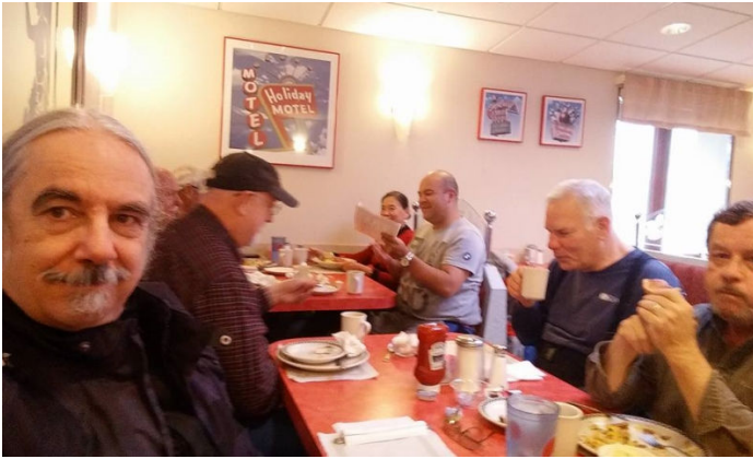
Apollo Diner - Farmingdale/Wall

A few pics from the last month's breakfasts: