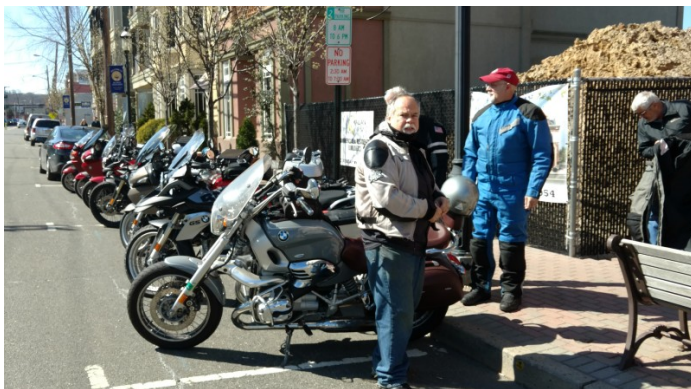
Breakfast Club in Atlantic Highlands

Saturday morning "Breakfast Club:" get-togethers have proven popular. The locations have moved around, and I'm always looking for suggestions in the general Monmouth/Ocean area.