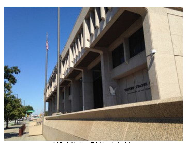
US Mint - Philadelphia

My first deviation from the slab was at the turnpike Exit 4 where I worked my way to the Benjamin Franklin Bridge. Factory Tours website lists the US Mint as one of several tours in this part of PA and I thought it would be interesting to check out a tour on my trip to Bob's BMW.