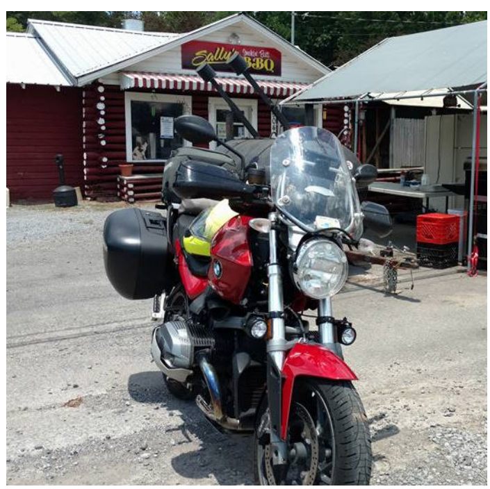
BBQ - need I say more?

Stopped in Fort Payne AL to meet a web friend, but he got stuck in a meeting so that didn't happen. What did happen was a stop at a BBQ place that was excellent. Had the smallest thing on the menu, and it was plenty.