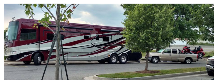
Wonder what he had in the tail-trunk of the Goldwing?

Some people obviously know how to travel in style.. seen in the CB parking lot: