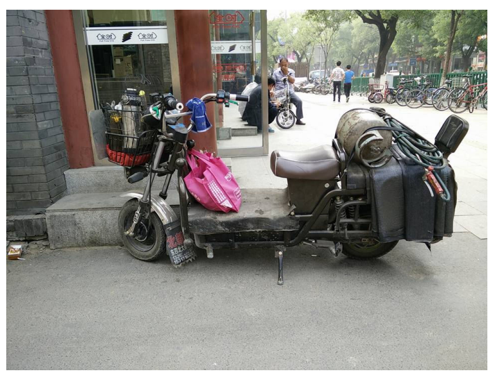
This is a heavy duty two wheel transporter. I wish I could have found an unladen one so you could see better. It has FOUR shock absorbers and a large cargo area behind the driver. It's electric.

Each train car has two (maybe more) bathrooms, one of which is "normal", the other has a stainless steel trimmed "hole in the floor" (not open to the track) that one squats over to relieve oneself. My knees aren't good enough for that, but so far I haven't needed to use a squat toilet. Also, make sure you carry your own toilet paper. This is in short supply everywhere; hotel rooms supply you with a role that is down to 20% or less, if you're *lucky*; one hotel supplied a little folded wad that amounted to a dozen or so "sheets" of toilet paper. Forget finding paper in a public toilet.