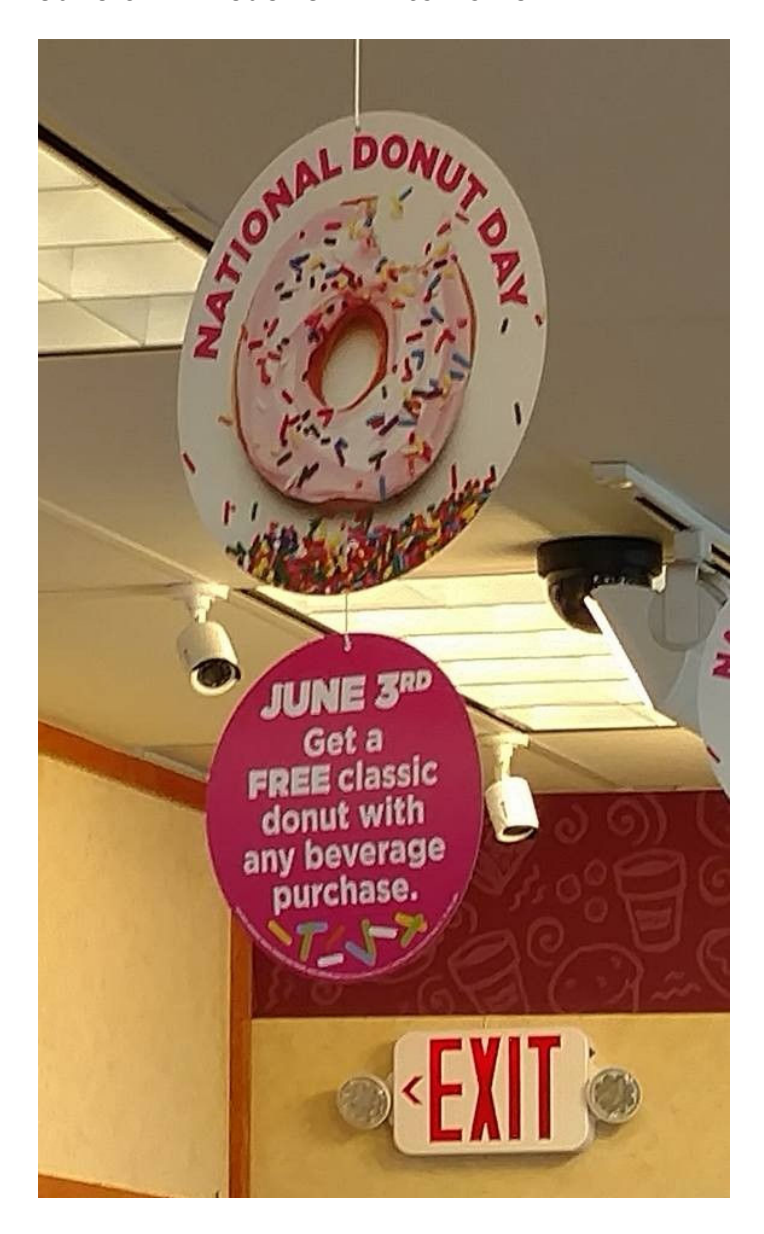
June 3<sup>rd</sup> – Frederick MD to home!

National Donut Day! That means a FREE donut at Dunkin Donuts (with purchase of any beverage, restrictions may apply, calories may be