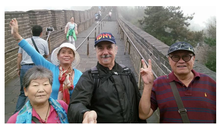
The "Long Wall"

The huge majority of scooter and motorcycle riders ride with no safety gear at all. However, many ride behind lap blankets, hippo hands, and sun-blocking face shields so as to avoid getting either wet, road-grimed, or sun-tanned. Further, plenty of scooters have some kind of roof accessory added on.