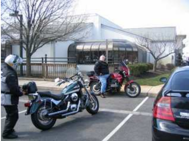
The BMW K75 Lends Dignity To Anyone, Usually Seen Here In Its Natural Element -- DeSimones BMW