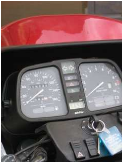
Note Dash Clock In Center... I Made It With 5 Minutes To Spare