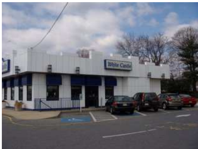
The White Castle In Toms River, NJ is Modeled After Windsor Castle In Great Britain White Castle Fact # 263

I let the dogs out and they tore the bird apart.