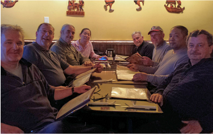
Super Pollo, Kennedy Shopping Center, Brick

Despite the name “Pollo” (chicken) – the menu was quite varied, and a number of the very reasonably priced entrees didn't have chicken, but some very delicious steak. It gets 4.7 stars on Google – I'd have to agree. Service was excellent, serving sizes generous and delicious. All at a very reasonable price.