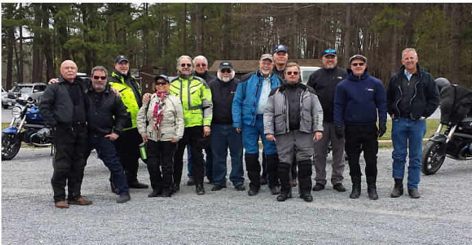
Some of our group..