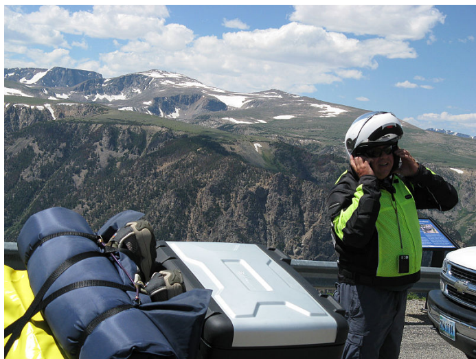
View from the Bear-Tooth Highway

We need your help since it takes almost 300 volunteers to set up and operate the registration function over 4 days.