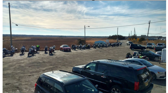
Mott's Creek Inn Parking Lot – 1/1/17

I'm sitting here puzzling over what to say.