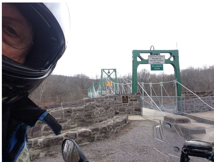
Montgomeryville Cycle was also a F.B.-III target

While going on-route, I took a couple short detours along the Delaware River to pick up some Fluffy Butt III sites (a pedestrian suspended bridge and lonely house chimney).