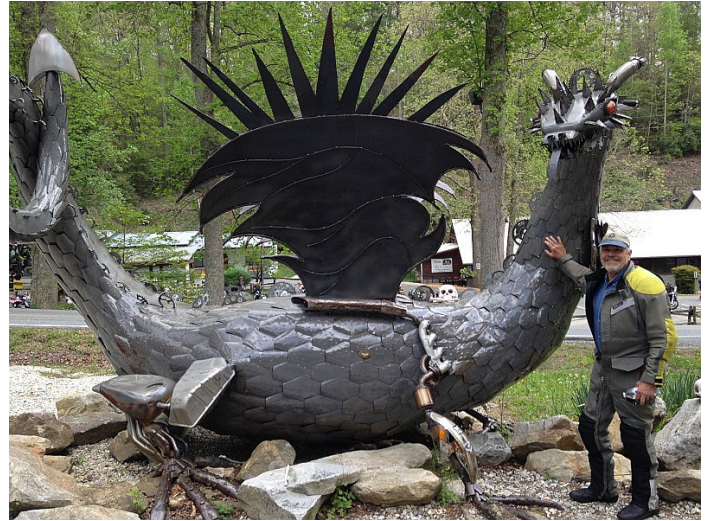
Herb at the end of the Dragon

and cars arrived. It was a good move; very little traffic on route 129, good weather, no RVs to slow us down, dry curves/road (318 curves in 11 miles = Dragon), and three police cars at the North end of the Dragon obviously planning their day's attack. We took a wide North-West-erly 160 mile loop which ended up back at Deals Gap/Dragon.