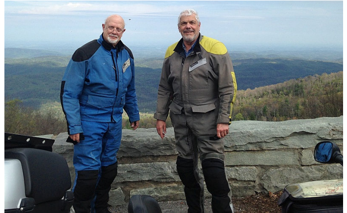
Someplace in Tennessee

then refinishes their wood cabinets. Now comes the "TV transmitter" part of the story. Because all TVs before mid 2000 were analog and not digital, the only way he can test and watch these old TVs is to have his own low-power TV station... in his garage. (located in a small 4' rack of equipment.) He receives digital TV programming via cable TV, converts it to "analog" signals and then transmits it to his antique TV collection around his house.