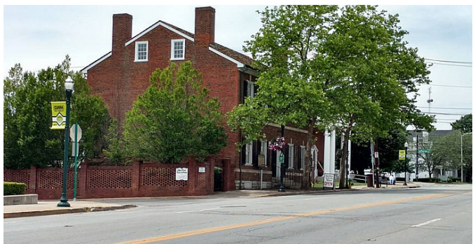
Mary Todd Lincoln's Childhood Home in Lexington KY

Day 3 (May 24 th ) – French Lick and West Baden Indiana. I'd passed through French Lick on the last trip – heading the other way. I just liked the name the first time. Then I saw the