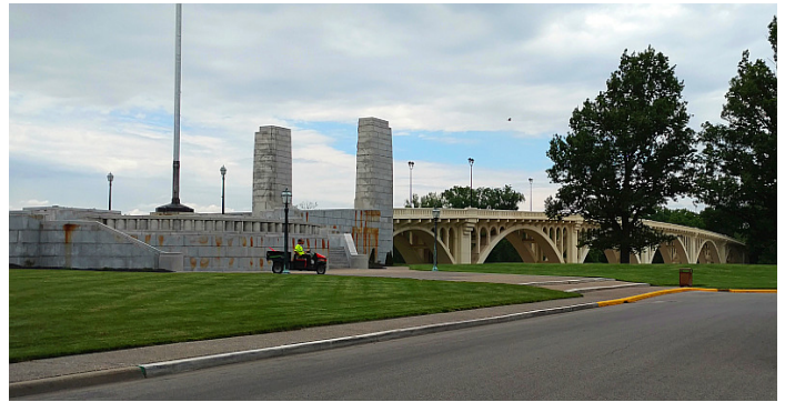
Vincennes Indiana to Illinois bridge. The Illinois side is nowhere near as nice.