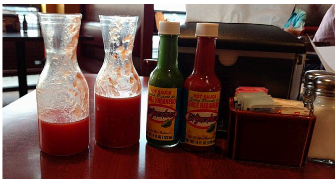
El Nopal: Warm, hot, hotter, nuclear.

Day 2 – Kentucky (May 23 rd ) – I've gone through Kentucky before – and found it has outstanding roads. I guess that's due to Mitch McConnell. He's probably using all the money Robert Bird used to get for West Virginia roads (which are now pretty awful.) Kentucky has some great riding through the horse country – and US-60 cuts right through. I ended up staying someplace not memorable (probably a free night at a Choice hotel of some kind), and having a fine dinner at El Nopal – a Mexican restaurant.