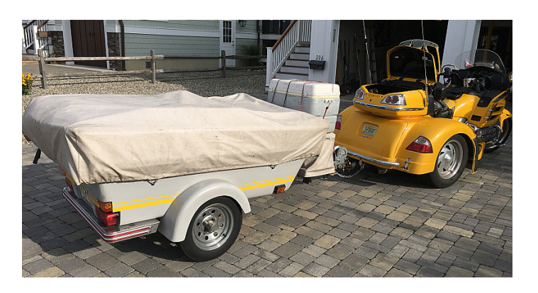
Yep...camping, people watching with lots of chatter along the way to of all places...IOWA.

Spontaneity is a great word for 'get up and go' which I did from Aug 5 thru 15th. It consisted of preparing Tweety and Bunkie (two hours) hopping on and then 'go west young man'.