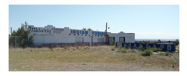
Day 10 - Winslow Arizona and the route there.

The next morning I was through Albuquerque well before noon. Aside from a credit-card failure caused by a bad 7-11 gasoline pump – about all that was notable was the route through the city was ALL under construction, and of course the detours bollixed up Doofus' route guidance, so I reverted to using her as a compass – heading west.