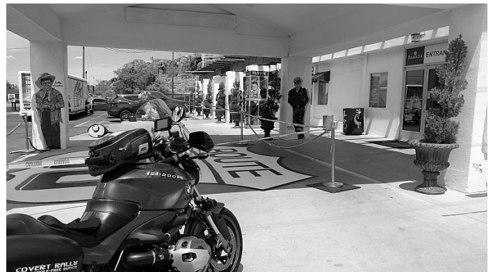
Ramada – Kingman AZ – recommended!

One place looked cool as I passed it. It also has an outdoor pool that's open (almost every motel pool I saw was "under renovation" at other places I'd stayed.) This is a Ramada, with an open outdoor pool, an attached bar, and an attached restaurant with a full sit-down breakfast included in the rate. It's a bit older, outside doors sorta place, but my door opens right to the pool area. Perfect.