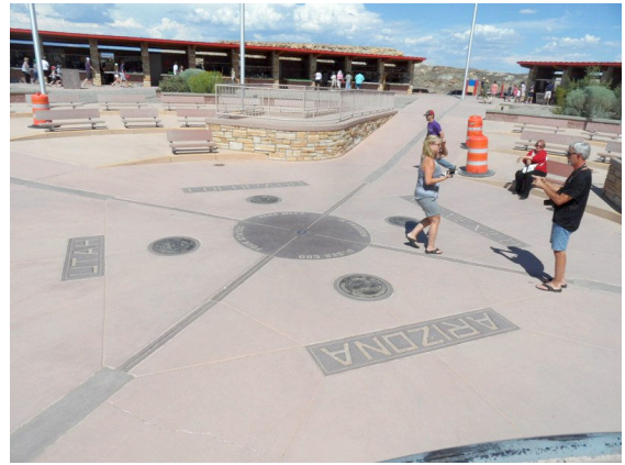
Four Corners Monument

After meeting our old club member, Dave Mason, somewhere south of Moab UT, Herb and I traveled south to visit 4-Corners (corner of states Utah, Colorado, New Mexico and Arizona). After a couple hundred miles we arrived at a Native American reservation sign inviting travelers into the exhibit. We parked near a large circular structure that housed “booths” for selling local native wares. It was 100 degrees and no water or food in site! In the center of the structure was a circular cement platform, about 10 foot diameter, which is supposed to indicate the exact point where the 4 States meet. Rumor has it that the actual intersection is a few miles away in a rougher terrain area.