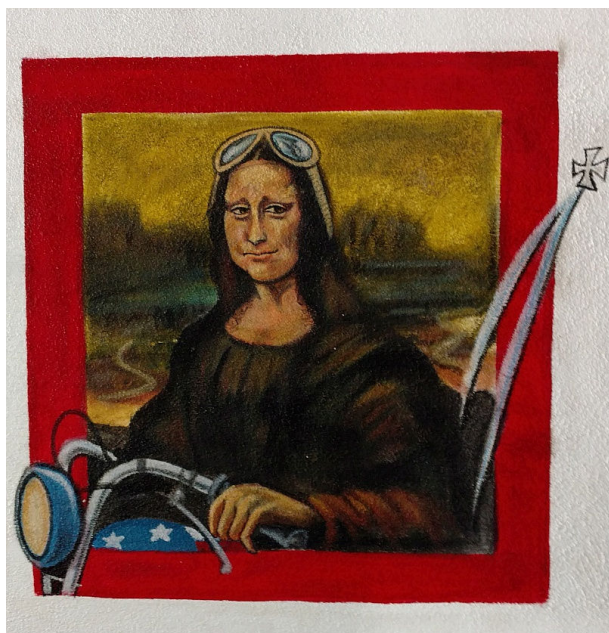
Motorcycles are welcome!

Needless to say, it's where I'm staying tonight. Sometimes it's good to put the brakes on early and continue the ride the next day.