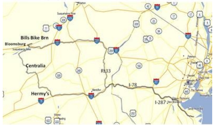
Trip to Bill's Bike Barn Museum near Bloomsburg PA. Approx 350 miles 8/27/17

On the way back to NJ, we headed south on two-laners and swung by Centralia, Pa. (home of the underground coal fires and an abandoned town) and Hermy's BMW. South of Hermy's we hit I78 and headed straight home. Overall we traveled 350 miles in about 10 hours.