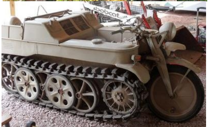
The famous WWII Kettenkrad.