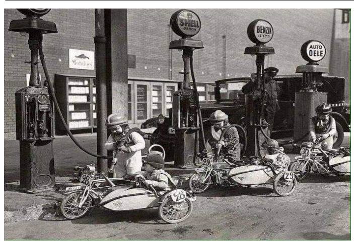
US Olympics Sidecar Team – Ventura CA

When last I wrote a President's Column I was in California wishing I was in NJ for the annual January 1<sup>st</sup> ride.