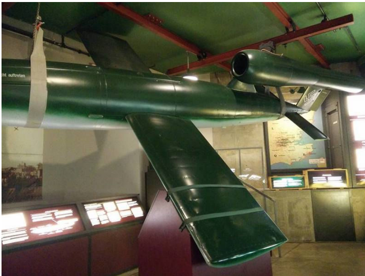
German V1 rocket.

The Cosmosphere is a space museum in Hutchinson, Kansas. Highly recommended.