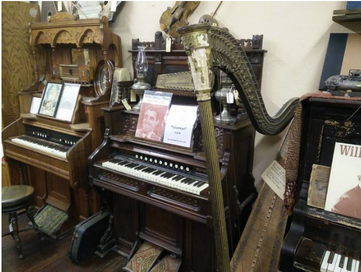
Musical instruments in the Tucumcari museum.

museum in Tucumcari, NM, but it didn't open until 10AM (and we'd gained an hour leaving Texas so we were there at 9) so we went to the Tucumcari Historical Society museum instead. That was pretty good, a huge range of "old stuff" – housewares, tools, clothing, guns, etc.