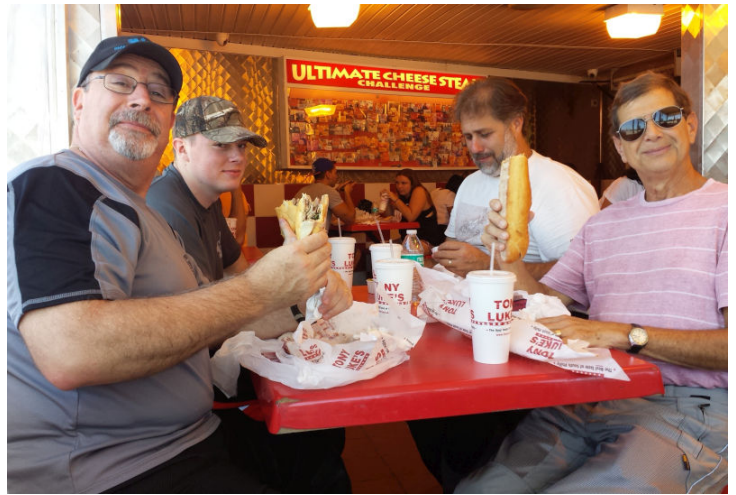
Ultimate Cheese Steak - Philadelphia - around 2014