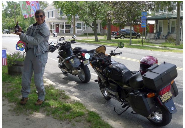
Hot Diggety Dog - Chatsworth - 2013? I used to own both of those bikes..