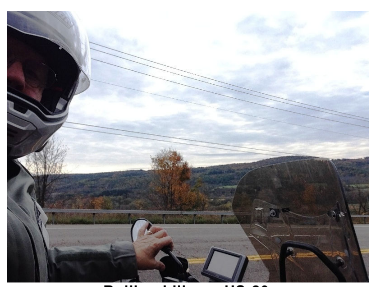
Rolling hills on US-20

I headed back to the cottage about 5pm following NYS I-90 and US Route 20 for an hour and half. Monday morning I headed east on US Route 20 to Pittsfield MA to visit my daughter and family. The fastest route would have been via the NY State Thruway I-90 from Syracuse through Albany to the MA Pike and then secondary roads to the Pittsfield area. However, being a very clear and relatively warm day (50-55 degrees) I decided to follow US Route 20 east ... all the way to Pittsfield.