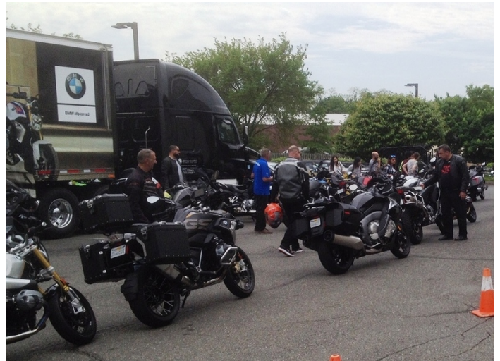
Demo van and riders

wanted to try an R1200 model since my previous BMW's were K bikes. With no further requests on my part, I was assigned the 2019 R1250GS Adventure. After a 15 minute rider's meeting we were told that there will be no shenanigans and to keep both wheels on the ground during the 30 minute ride. This did not stop people from asking if the traction control will kick in during a wheelie or during an intentional rear wheel lock up. Yes and yes, but don't do it. The rep then spoke about the electronics and various rider's assistance features the bikes offer. The new bikes also have "keyless go" which allows you to push a button to wake up the bike and another push to start the bike. Very nice idea and no paint to scratch.