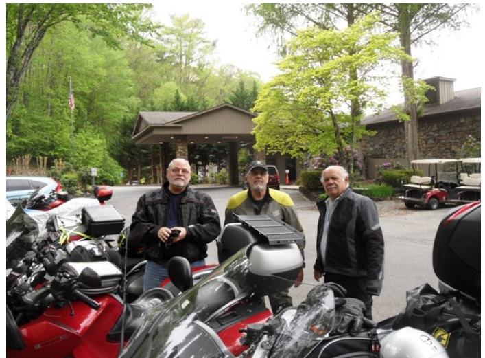
Group (less me) arriving at Fontana Resort/Lodge on Thursday afternoon. We arrived 1 day early to take advantage of more riding in the area.

As far as we could see no traffic was moving. Eventually in a mile or so we were able to take an exit into the foot hills of the Smokey's.... Doofus the GPS indicated a path back onto the interstate in 10-12 miles. Doofus was correct but with a bunch of other cars we did stop-&-go on I-40 again.