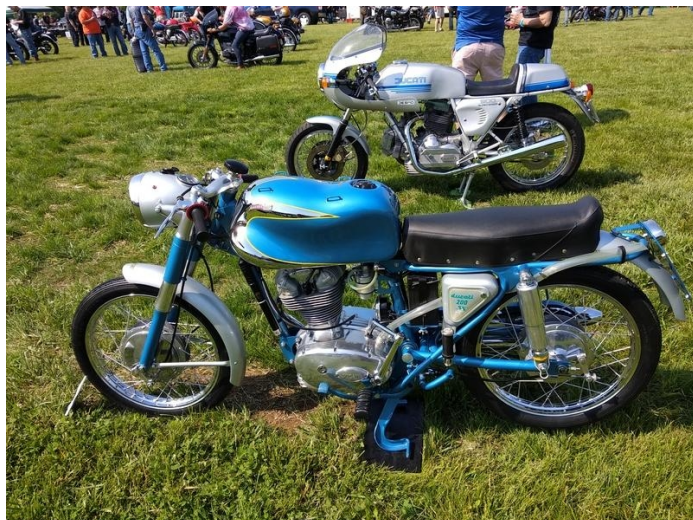
A brace of Ducatis.