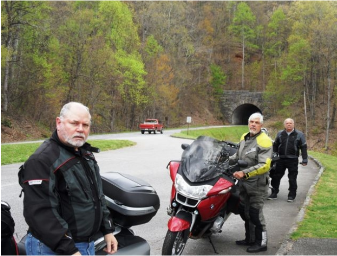
Tunnel on the Blue Ridge Parkway

excellent and challenging with tight curves and switchbacks.