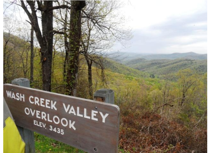
View from the BRP. Last August in the rain and fog, I couldn't even see the sign.