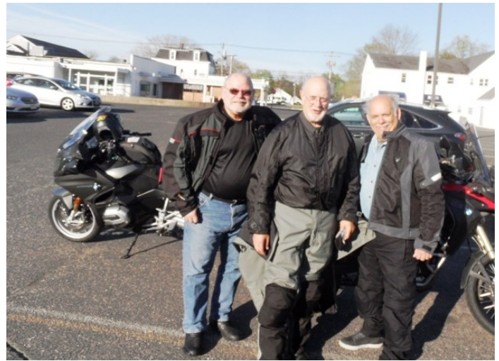
The travelling "breakfast club"

Our "heads down" route took us down I-81 past Roanoke VA, South on I-77 into North Carolina, West on I-40 to Ashville. Just as we started up the mountains on I-40, we stopped dead in our tracks.