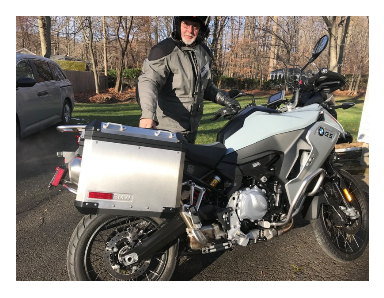
In late November I rolled into Max's BMW near Troy NY on a weekend visit to my daughter's

In my December Prez column the picture depicts a Santa Claus receiving a new bike from his helpers. Little did I know how true it would be.