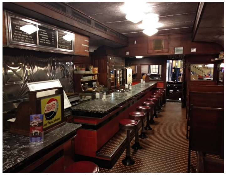
Interior of restored "railroad car" diner in the museum

Seminars were offered on replacing main seals, patching tubes and tires, fixing the charging system, and many other topics. The author presented a lecture on adding electrical accessories and upgrades to these motorcycles. One presenter did a live demonstration that compared five different brands of gasoline "stabilizer", with surprising results: "Stabil" did not perform very well, but a brand sold at Home Depot passed all the tests.