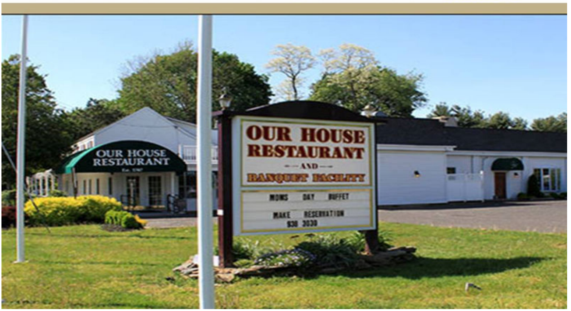
Eat @ 6PM Business meeting starts at 7:30PM

Our House Restaurant : 420 Adelphia Rd., Farmingdale, New Jersey 07727 . Tel # 732.938.5159