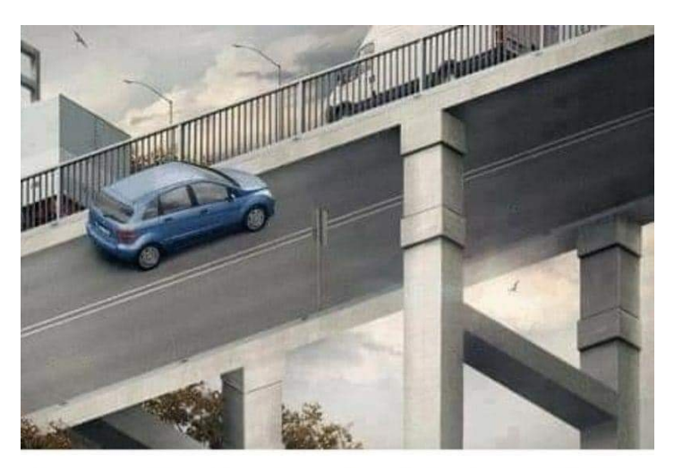
I regretted buying the Escher GPS.