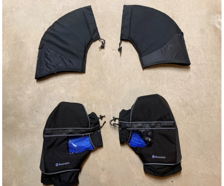
Comparison of "generic" vs. Wunderlich handlebar muffs.