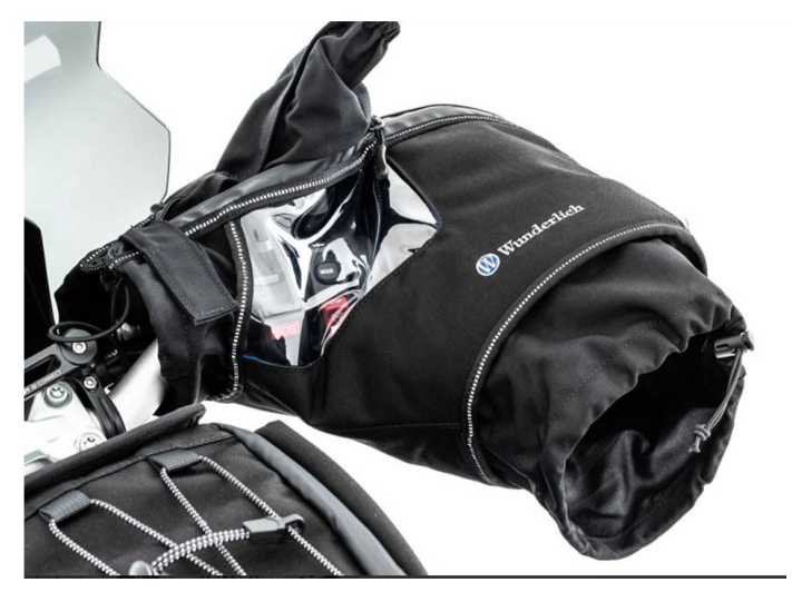
Wunderlich Handlebar Muff. Easy to install. Insulated, window to see controls, mirror boot, forearm drawstring enclosure.

Muffs at the raffle. Looking as if he won an old wet tee shirt, he was more than happy to take my cash offer. Prices range from under $20 for the cheap, less featured generics to $200 for the best name brand ones (full featured).