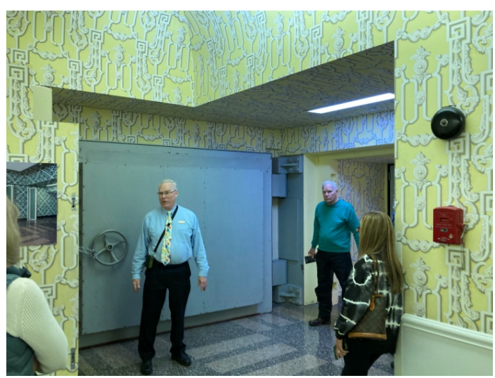
For three decades that the bunker was ac-

tive, the door was hidden behind a screen that made it look like it was part of the wall.