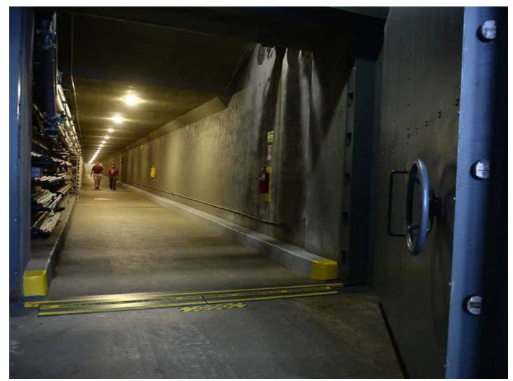
Another access door between truck terminal and inside bunker