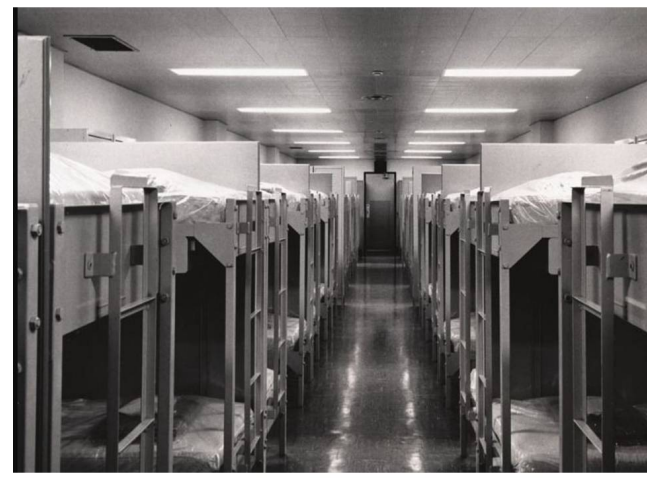
Typical living quarters for "Congress."

tive, the door was hidden behind a screen that made it look like it was part of the wall.