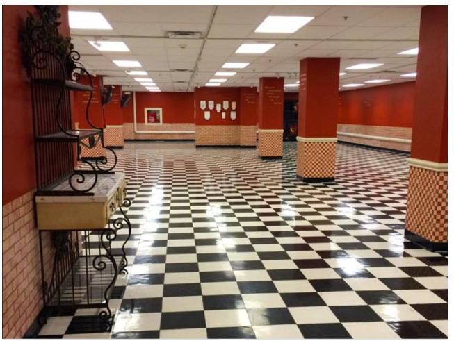
Multipurpose meeting room within the bunker. Note the size of columns.... enough to hold up a 5' thick concrete ceiling.