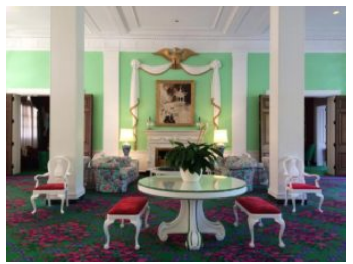
The Greenbrier Hotel lobby., Who would have thought that the government housed a secret bunker underneath?