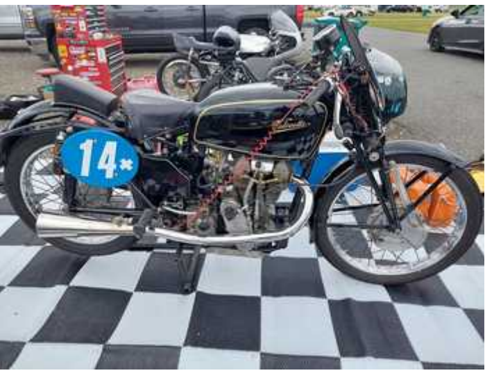
1948 (IIRC) Velocette. One of only 2 in the country supposedly from the late 40's

Well weathered R?? Sidecar outfit keeping the Velo company.