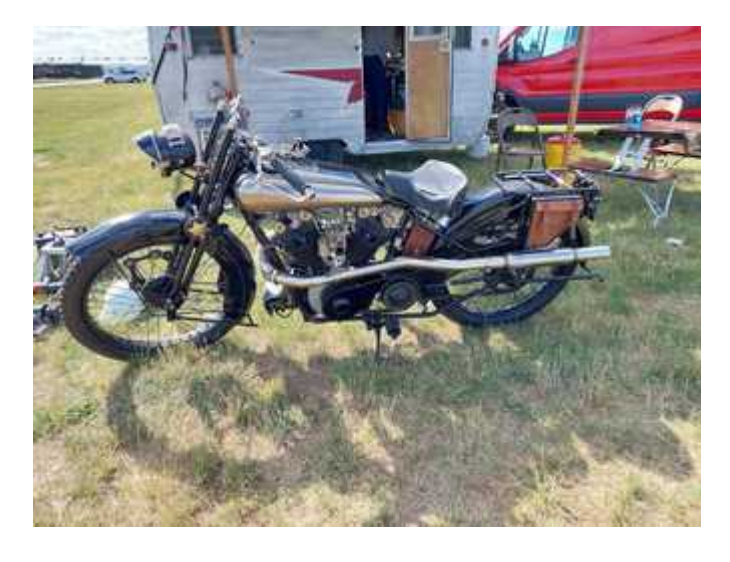
Hand Built Reproduction Brough SS100. Cunningly finished using "Rustoleum" black which