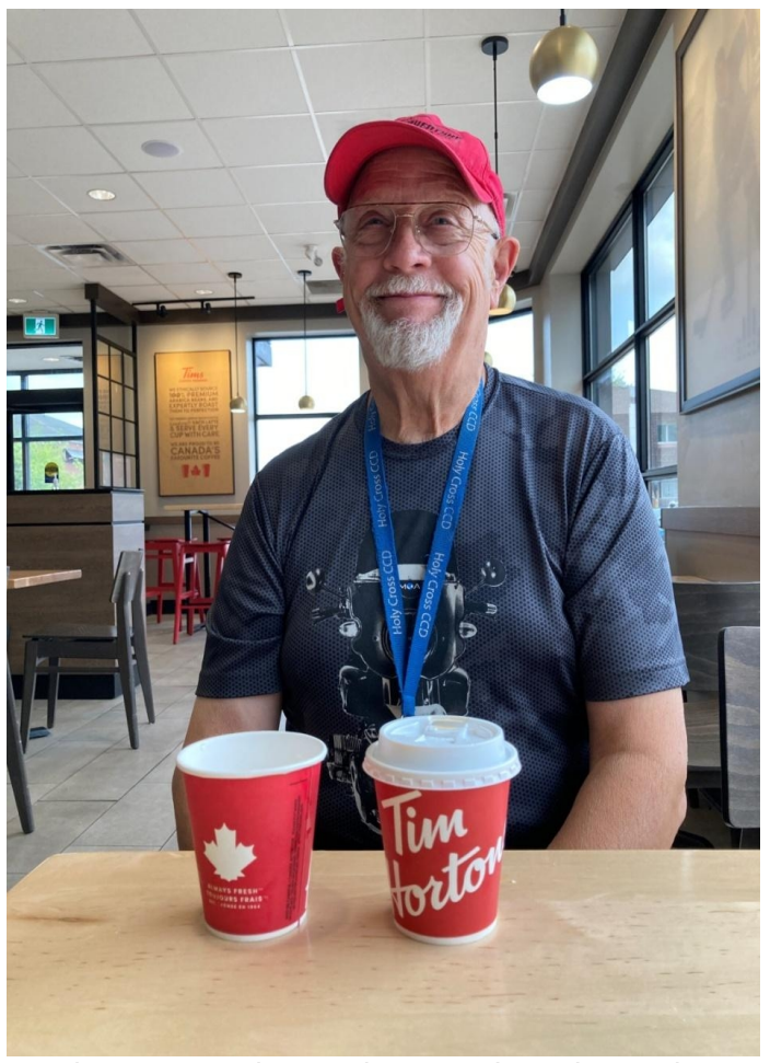
Tim Horton pit-stop in Canada. Where else would you get Duncan-Donuts-like coffee and maple sugar flavored donuts.

(who is still caring for her 100 yr old mother). Overall, I put on 1592 miles in 5 days. As with most of my long distance trips, I created a video. See <a href="https://www.youtube.com/watch?">https://www.youtube.com/watch?</a> <a href="https://www.youtube.com/watch?">v=yVnnLapVp8U</a>