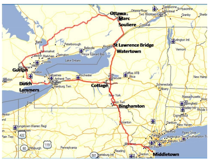
Overall trip to Guelph CN and Ottawa CN, 1592 miles in 5 days.

Then three days before our border crossing, I completed website input to identify where I would be staying, how many days, date of return... and then answering Covid questions (symptoms in last 24 hours, etc.). The Canadian government then emailed me an approval document with