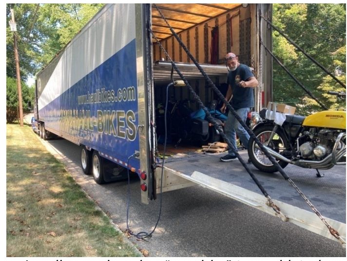
Loading and saying "good-by" to my historic Honda 400F.