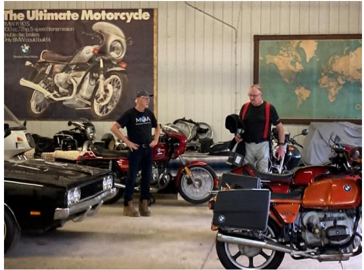
Taking a tour of Dutch's garage and viewing all of his restored bikes and cars.

head gauges & tools, and a stock-room overflowing with parts (all parts sorted and stored neatly on shelves), including mufflers, tanks, seats, dashboards, heads, etc. Henning and I spent more than an hour touring his garage and asking questions.