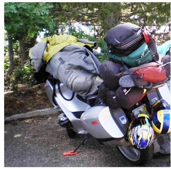
We're assuming this person doesn't travel with a passenger.