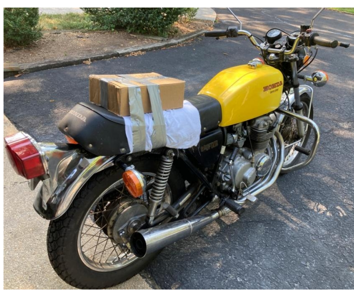
My 1976 Honda 400 Super Sport F4, prepared for send-off. Destination: Classic Runners in Torrance Ca, a company that buys-sells unique (high-demand) performance motorcycles. The cardboard box contains spare parts.