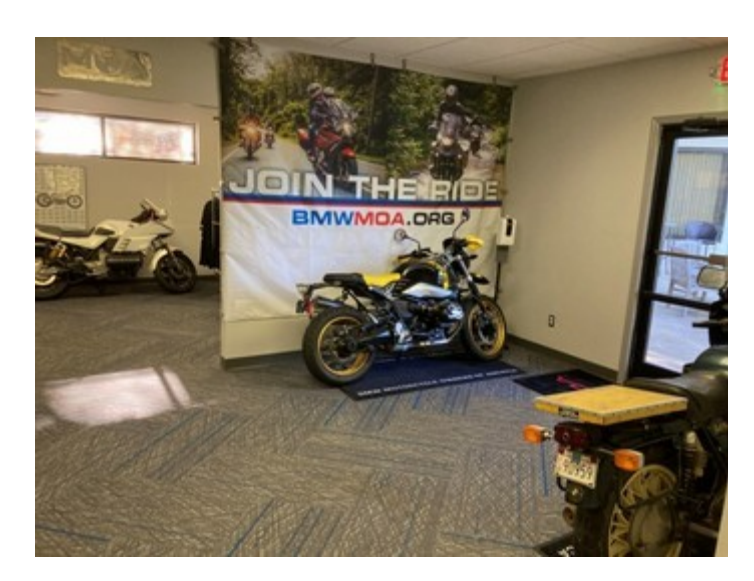
Inside of the MOA HQs in Greer SC. First floor consists of offices and merchandise storage; the second floor is being rehabbed for a motorcycle museum. Tonya is the only full time staff person