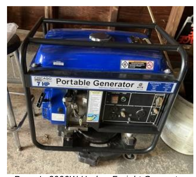
Roger's 3000W Harbor Freight Generator