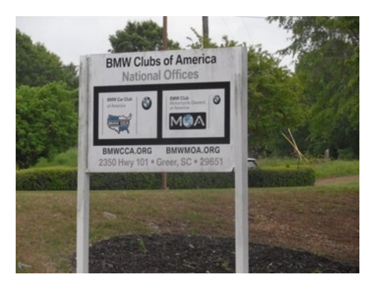
The MOA shares its location with the BMW Car Club in Greer SC. They also did this when located in Greenville. It's a good relationship.