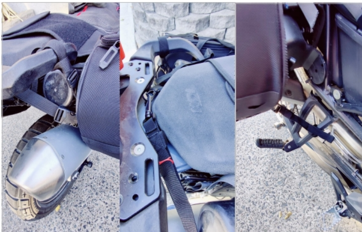
Three views of the attachment straps.

Normally (i.e., no tool tubes) the large hook & loop straps would have much more overlap, but this was very secure as is. Besides, I always have a rear seat mounted tail bag on top of it. So, no problem. One benefit of the right side tool tube is that it keeps the bag sufficiently away from the muffler.