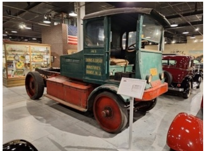
battery electric truck at BMHV