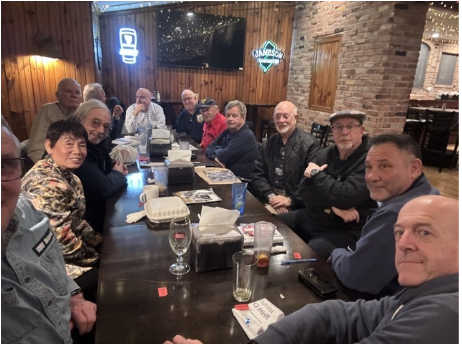
The meeting at Woody's on Feb 12.