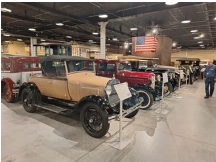
more from BMHV